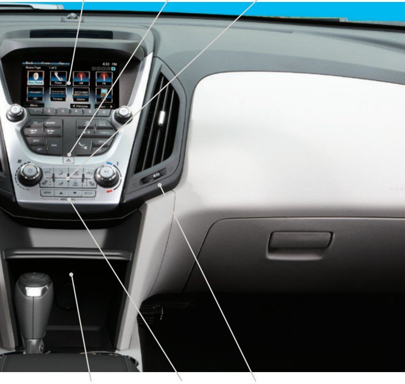
Accessory Power Outlet